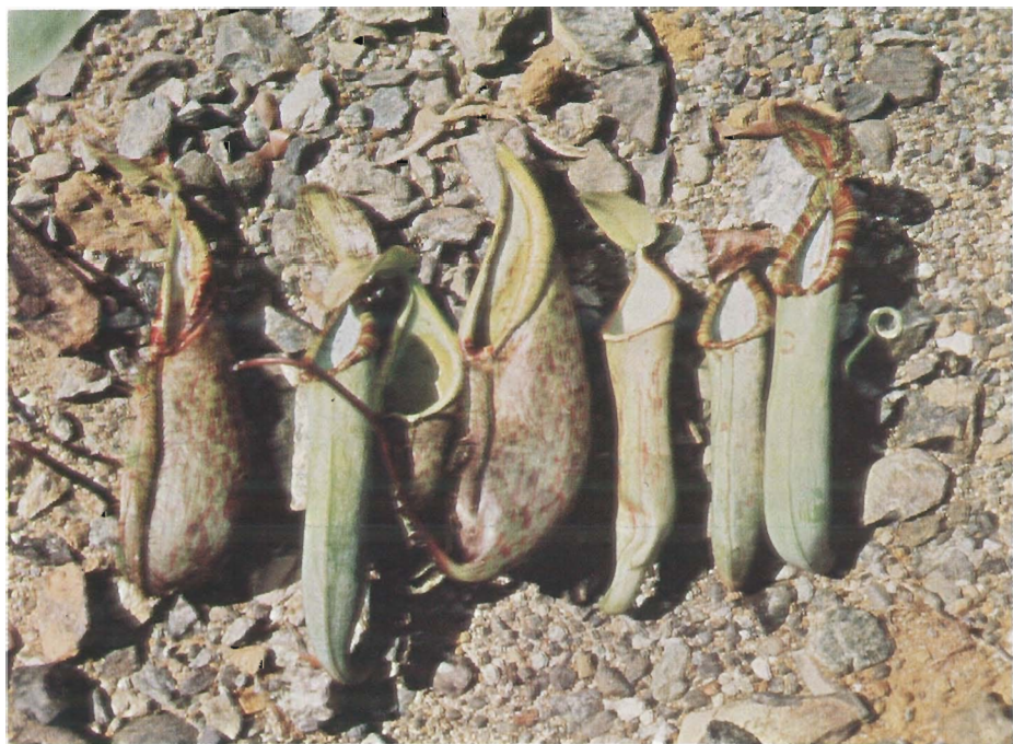
N. macrovulgaris . Upper and lower pitcher selection.