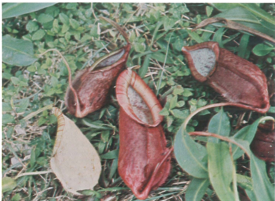
Nepenthes macrovulgaris (Turnbull)