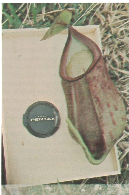
N. macrovulgaris (Turnbull)