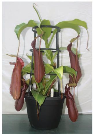
Plant not included

Ferocious Foliage P.O. Box 458 Dahlonega, GA 30533