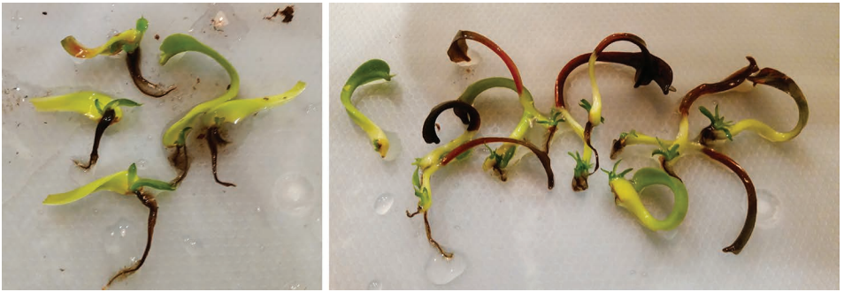
Figure 5: Rooted leaves after 2-3 months.