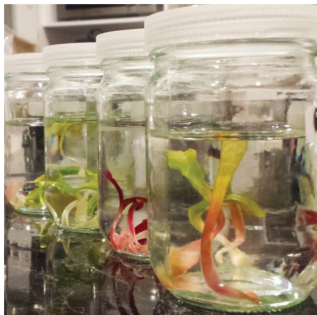
Figure 3: Trimmed leaves in jars.