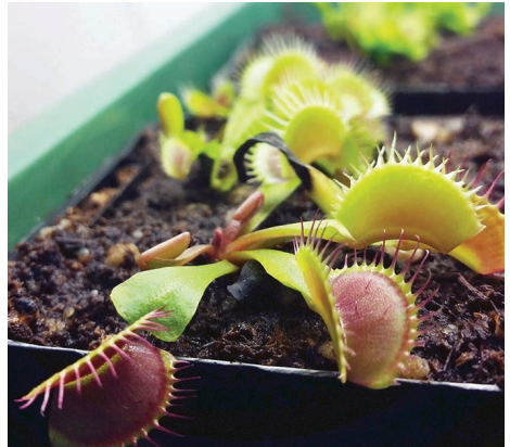
Figure 1: Dionaea 'B52' growth after 2 months.

Note: Don't forget to repot the original plant (Fig. 1).