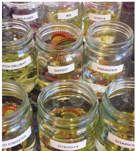
Figure 2: Pulled leaves before trimming.