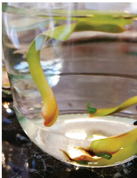
Figure 4: Trimmed leaves after a month.